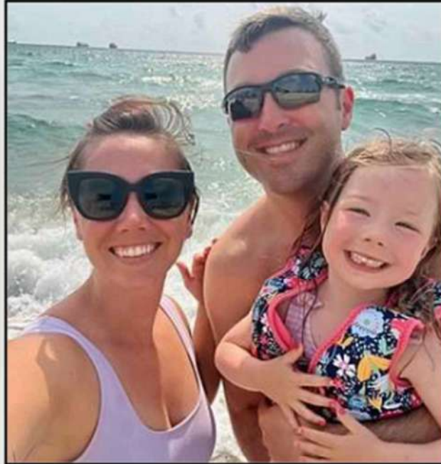
Disney Cruise vacation! We look forward to bringing your child on our adventures!