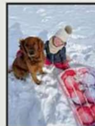
Winter fun in the snow! Even when it's cold we find time to be outside