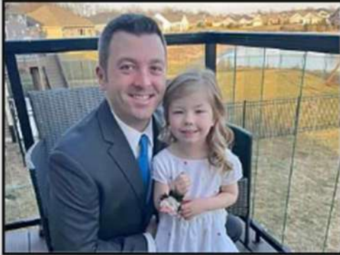
Father Daughter Dance