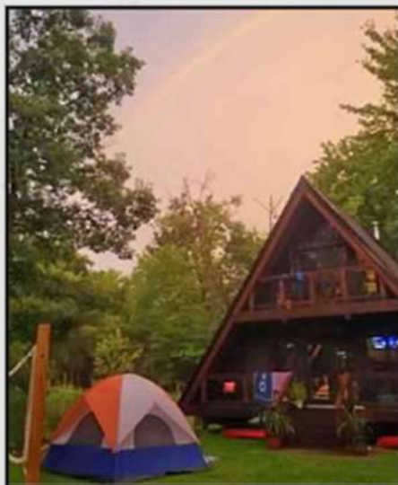
Time spent camping on the lake and in our backyard!