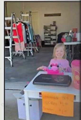
Garage sale and lemonade stand this summer