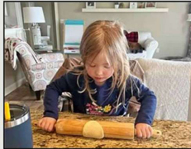
She is always helping me cook and bake in the kitchen! We have homecooked meals at least 5x a week.