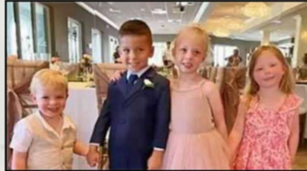
More cousins that are from Florida and North Carolina! It's such a joy to get the kids together