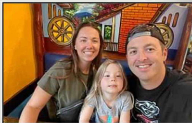
We love going to the Mexican restaurant down the street! On nice days we will even ride our bikes.