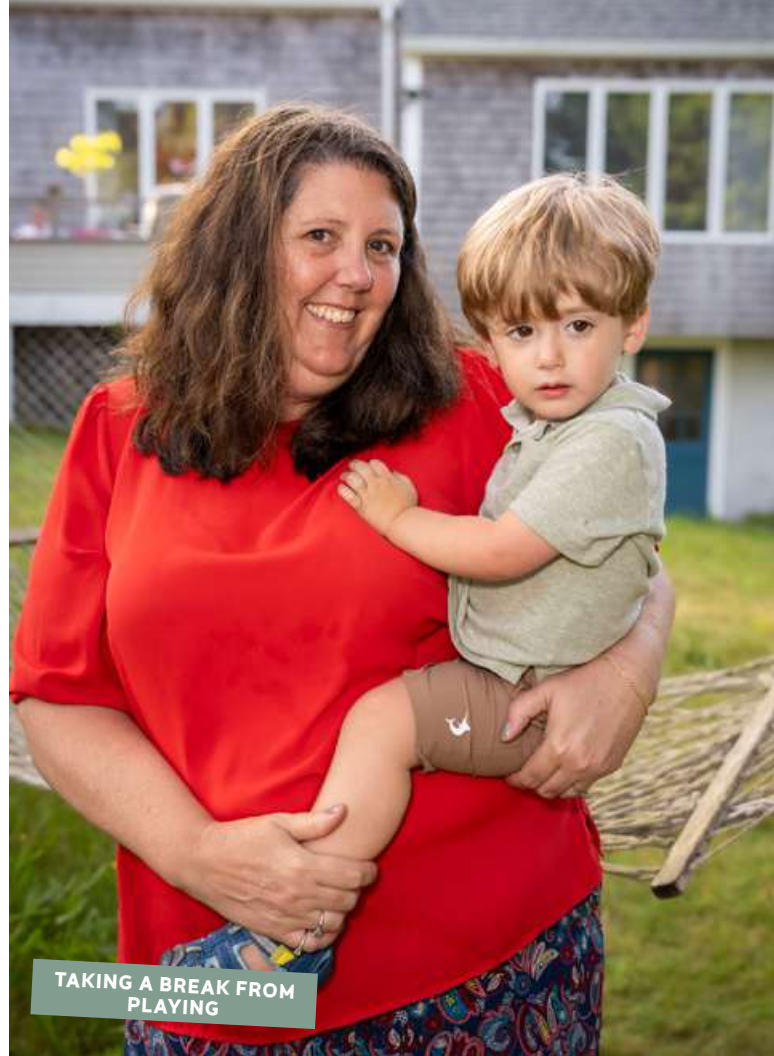
TAKING A BREAK FROM PLAYING

Nothing, however, compares to the joy I see in her since becoming a mother.