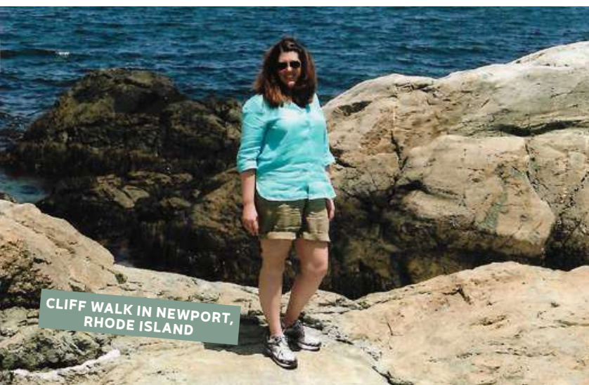
CLIFF WALK IN NEWPORT, RHODE ISLAND