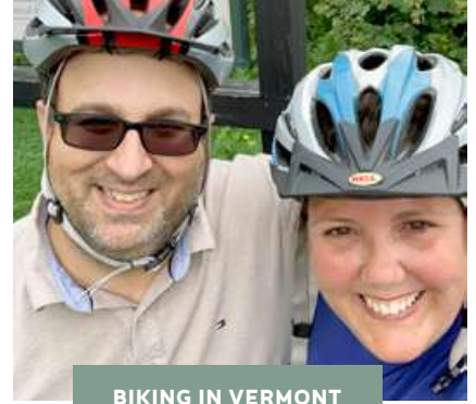
BIKING IN VERMONT

We met the "old fashioned" way...online!