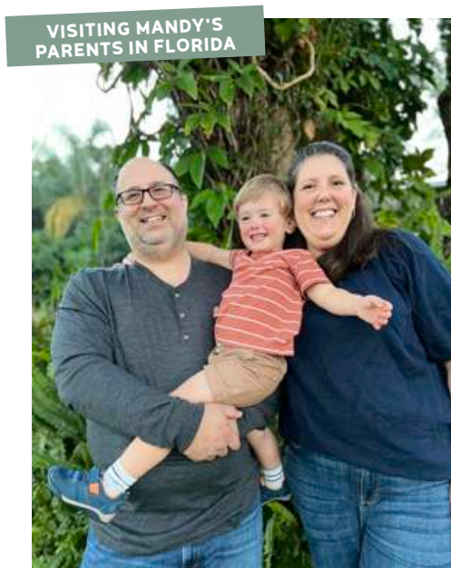
VISITING MANDY'S PARENTS IN FLORIDA