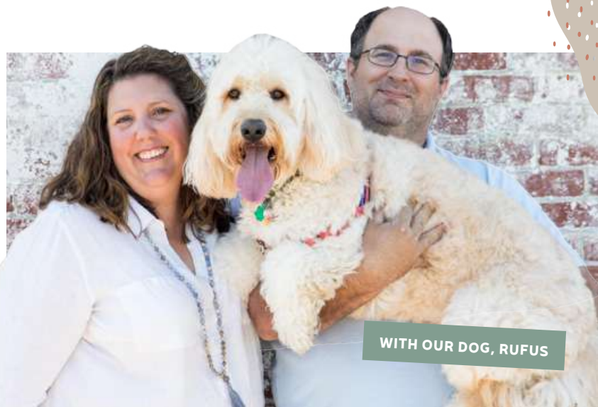
WITH OUR DOG, RUFUS

We love our little family, adore being parents, and have so much love to give. Thank you for getting to know us a little bit more!