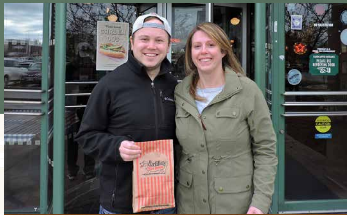
We enjoy going out for meals especially to one of our favorite places-Portillo's