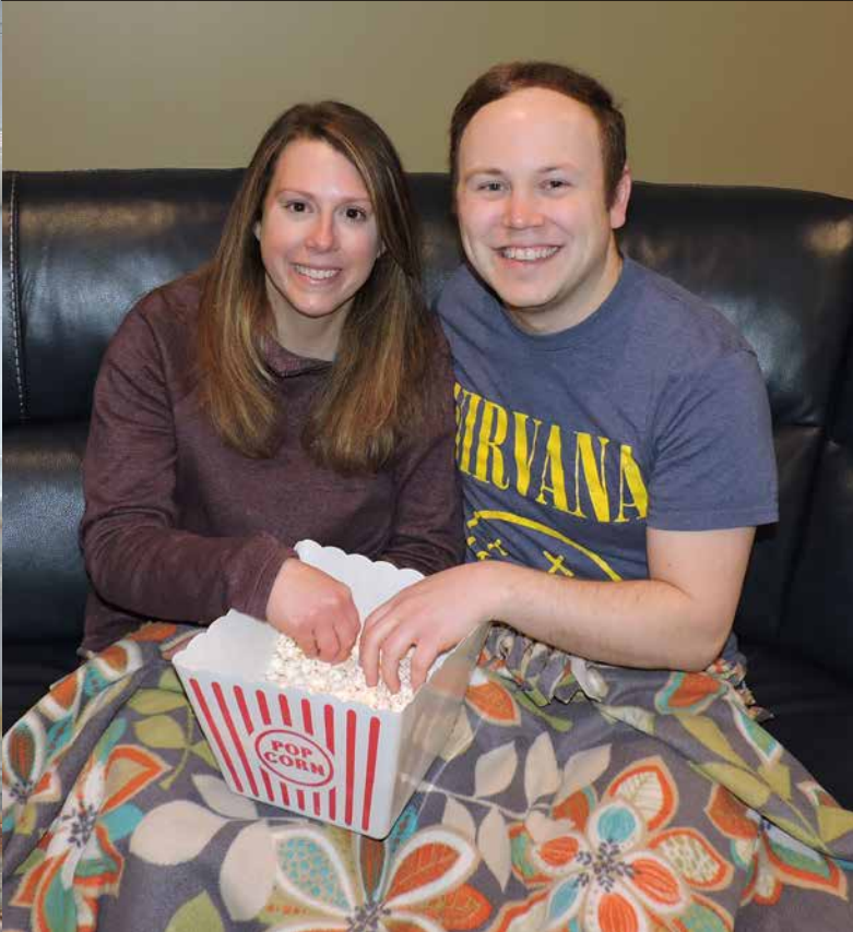
Movie night complete with a bucket of buttery popcorn!