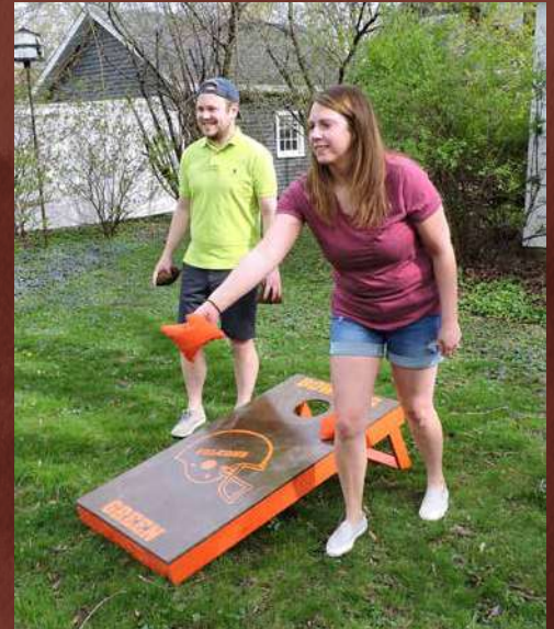
Playing corn hole in the backyard