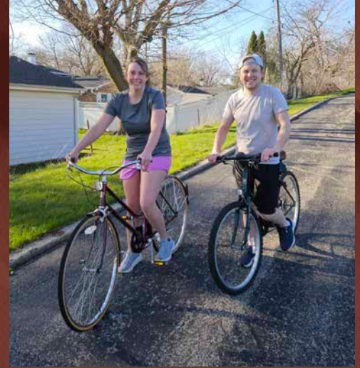
Riding bikes in our neighborhood