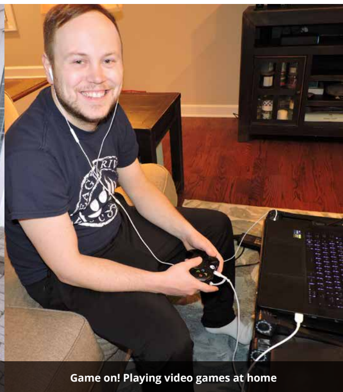
Game on! Playing video games at home