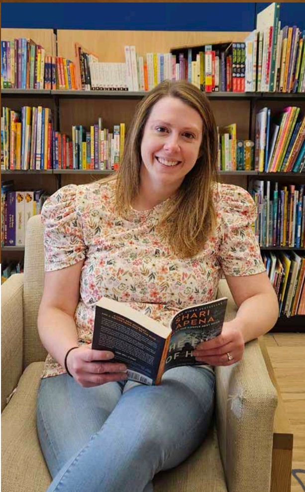
Browsing and reading at the book store