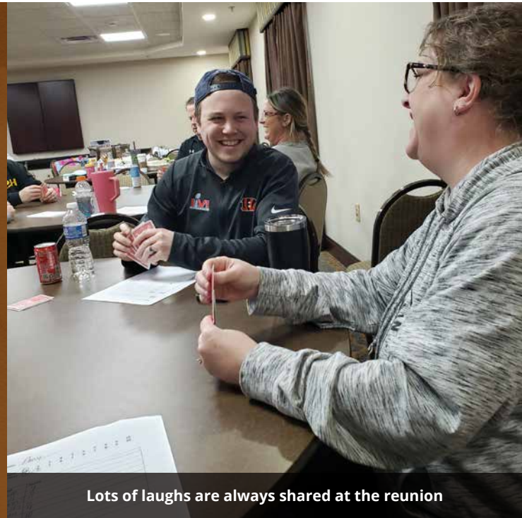
Lots of laughs are always shared at the reunion

We meet the same weekend each year at a hotel where we eat, drink and play cards and other games. There are usually 50-70 people who attend, and it is always great to get to see and spend time with extended family we don't see often. Both the adults and children have a blast every time, it is something we look forward to each year.