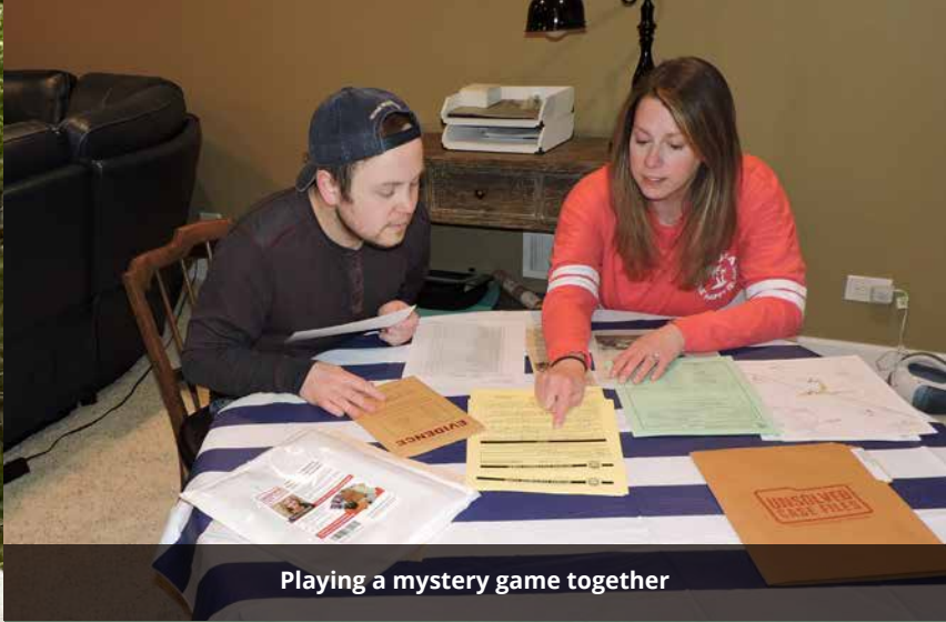
Playing a mystery game together