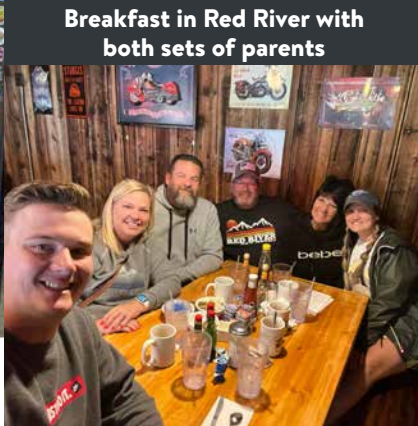
Breakfast in Red River with both sets of parents