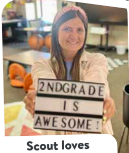
Scout loves teaching the littles