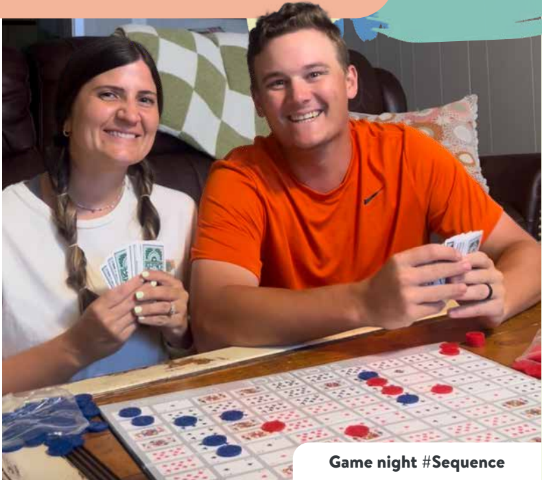
Game night #Sequence