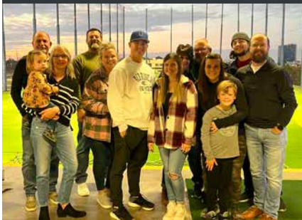
Scout's birthday with our whole family