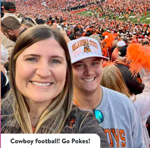
Cowboy football! Go Pokes!