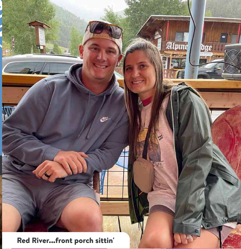
Red River...front porch sittin'